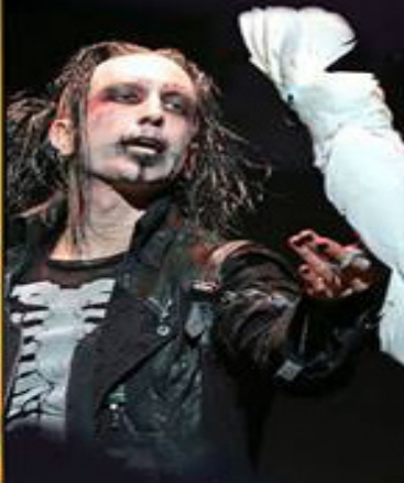
Dan Sperry Star of Hit Touring Show The Illusionist