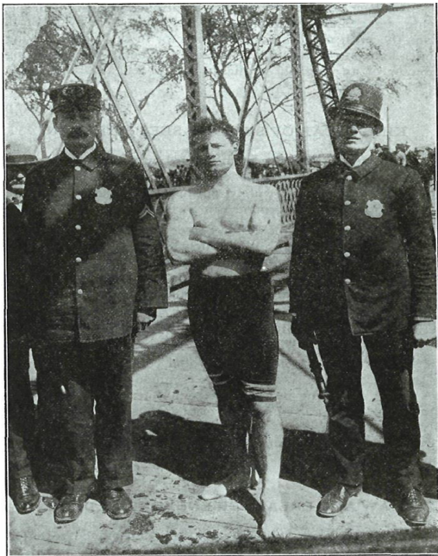
Police and Hardeen Prior to Ohio River Bridge Jump

Hardeen Memorial Issue Conjurer's Magazine July 1945