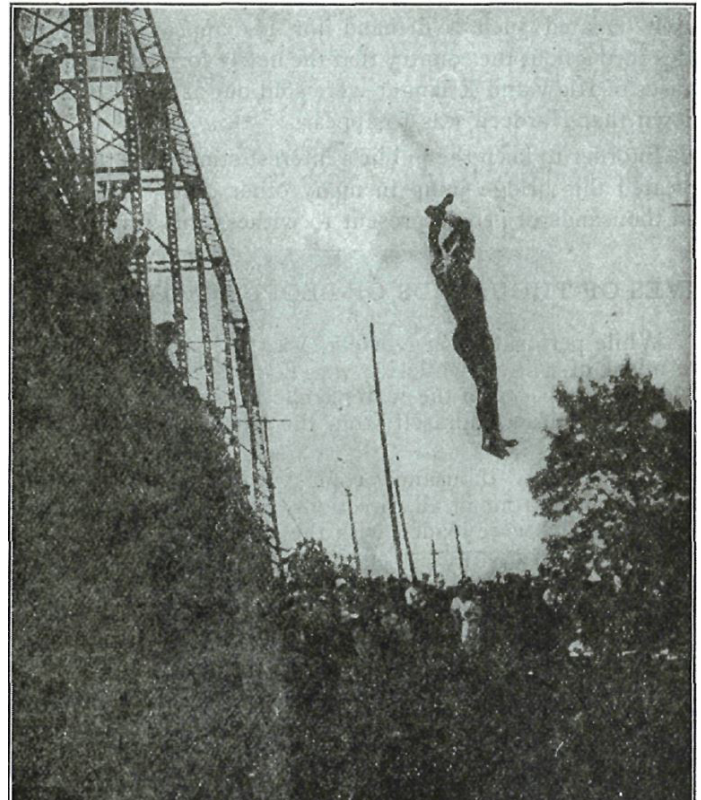
Hardeen jumping from bridge into Ohio River